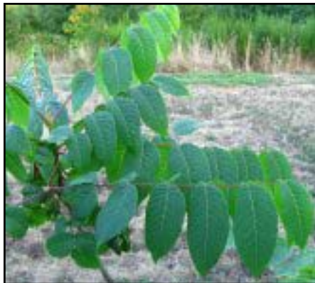
Black Walnut pollen can cause breathing difficulty, contact with walnut shavings can result in laminitis.

This is part 2 of a series of articles about plants common to the Northwest that contain toxins and can be deadly to your horses. It will include symptoms of poisoning typical of the plant described and treatment, if any is available. Remember, most horses will not eat things that are not good for them if they have something else to eat instead.