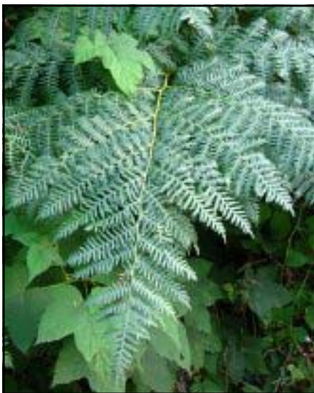
Horses that eat Bracken Fern can develop a serious vitamin B1 deficiency.