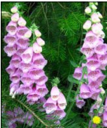
Foxglove contains digitalis, a strong compound used in heart medications.