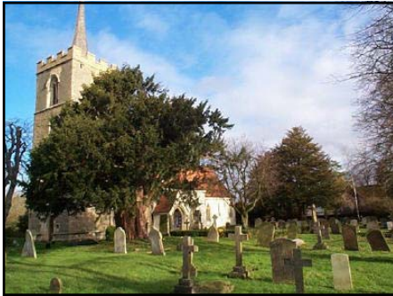
Yew trees were commonly planted in churchyards; the trees have a close history with ancient religious rites. Yew trees are highly poisonous and produce distinctive red berries as pictured below.