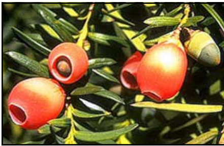
A close-up look at the needles and berries of a Yew tree.