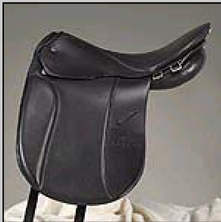
The 2005 Best Gaited Horse of Show at the Evergreen Gaited Horse Classic will receive a Stübben Gaited Pleasure Saddle donated by Noble Horse Saddlery.

Stübben, the world's largest hand-made saddle maker, recently expanded their line to include specialized saddles for the gaited horse breeds. More specifically, the Gaited Pleasure and Icelandic Saddles are getting overwhelming response in Europe, and well on their way to stardom here in North America.