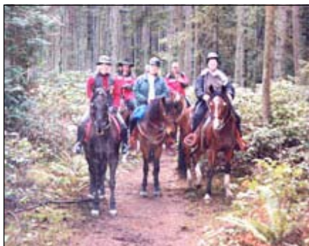
NGHC members enjoy a day on the trails at Bridle Trails State Park in November.