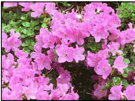
Rhododendron and azalea are common ornamental plants in the Northwest. All parts of these plants are toxic.

The following is an actual posting taken from an Internet message board: